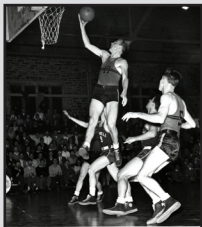
Princeton basketball once played at Hobey Baker Rink.

Hobey Baker Rink was used as a hotel during WWII for servicemen.